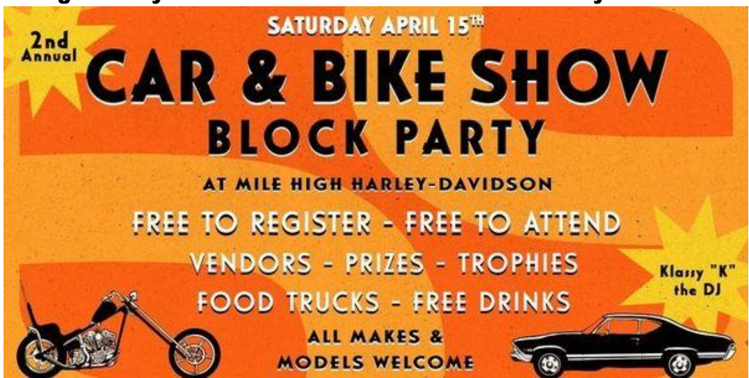
4/15 – Mile High Harley-Davidson Car & Bike Show Block Party. See below.

15 April 2023 11:00am to 3:00pm MILE HIGH HARLEY-DAVIDSON 16565 E 33rd Dr, Aurora, CO 80011